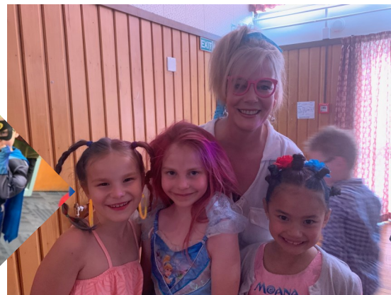
Some fun and whacky hair from the Junior Disco last Friday evening.