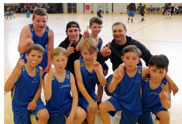
Yr 3/4 Donovan Dunkers