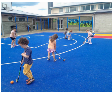
Room 19 having Hockey Fun!

We also have Jump Jam (all Syndicates) starting up in Term 2. They do a massive Jump Jam Festival. It starts from 9:00am for the Juniors. 10:00am for the Seniors and Middles. It ends around 3:00 or 4:00pm.